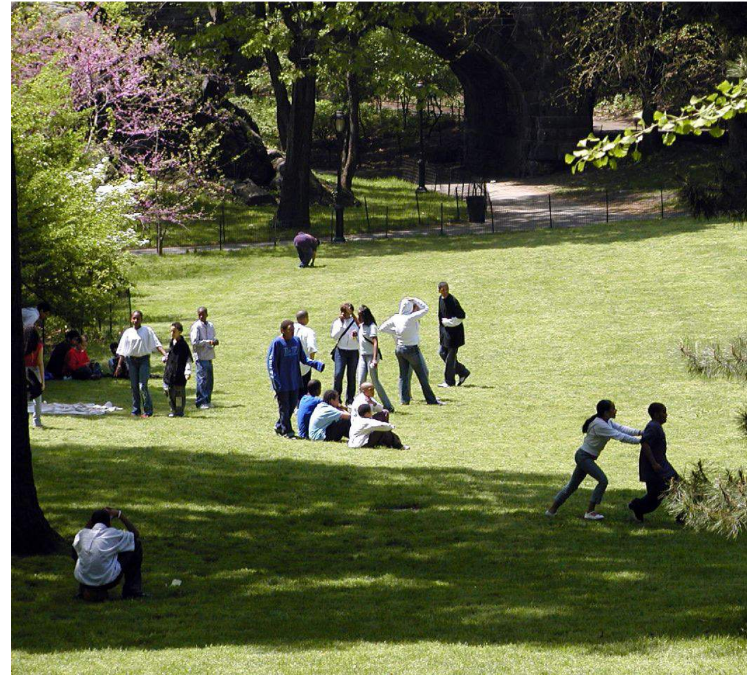
Park that harmonizes with the city (New York, New York)