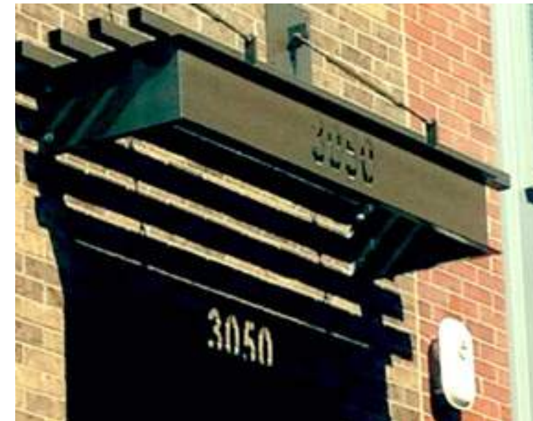
Facade that illustrates the building's address number by utilizing light and shade patterns (New York, New York)