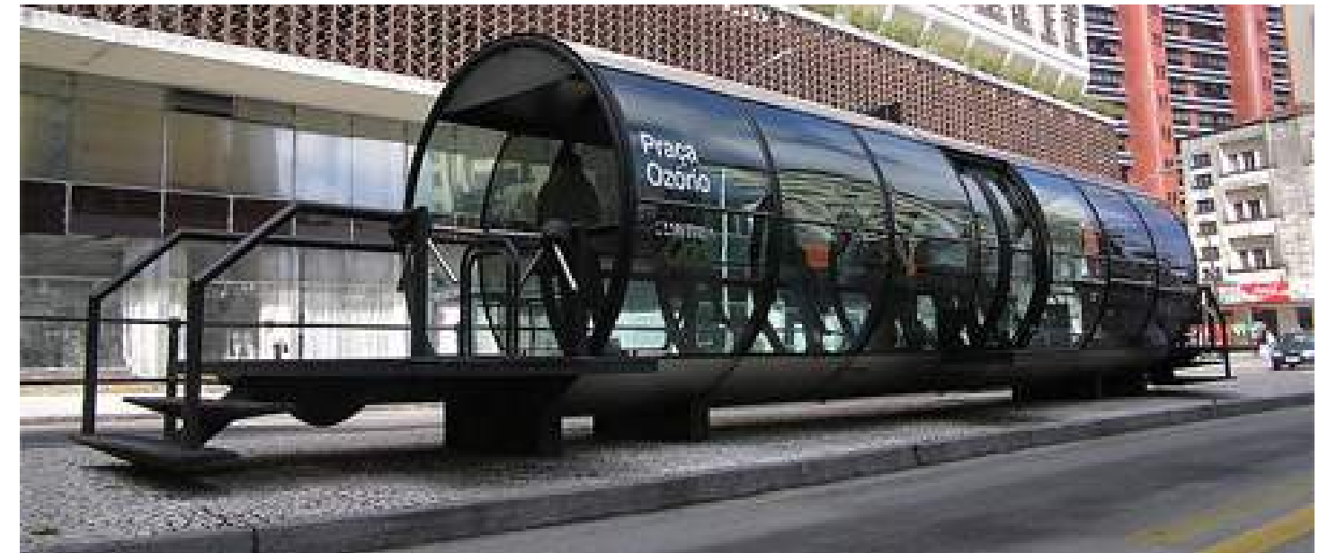
Bus shelter (Curitiba, Brazil)

-Assure that routes and stops are easily navigable through the implementation of recurrent signage, iconography, and maps. {4}