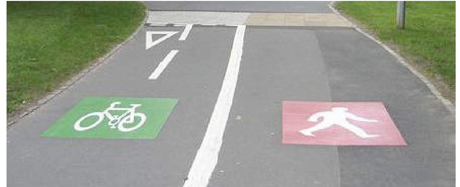
Bike lane separated from road and varied color palette (London, England)

-Create a bike network that encompasses bike specific signage (traffic lights, speed limits), consists of distinct and visible road markings (directional arrows, varied color palettes), leads to spaces that children enjoy or heavily use (playgrounds, parks, schools), and is separated or protected from automobile traffic (on-street parking, green islands). {4 & 10}