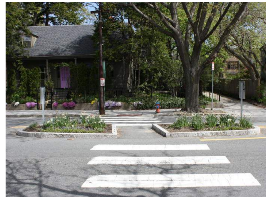
Different crosswalk material (Venice, Florida)