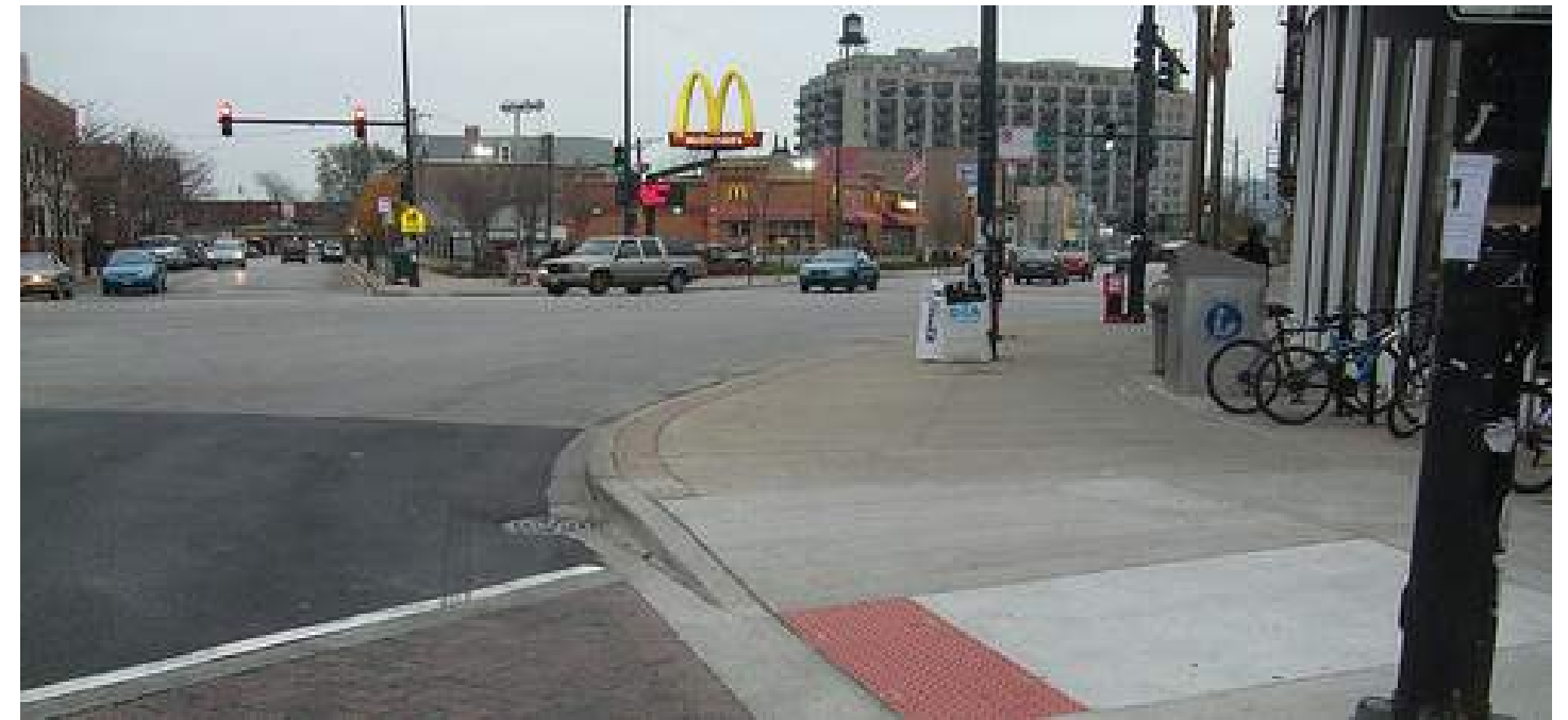
Sidewalk grade change (Chicago, Illinois)