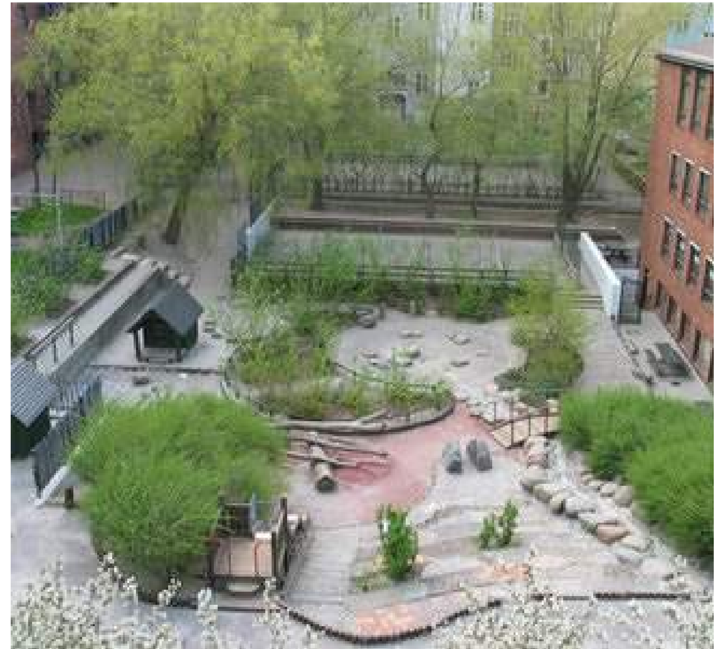
Nature playground at school (Copenhagen, Denmark)