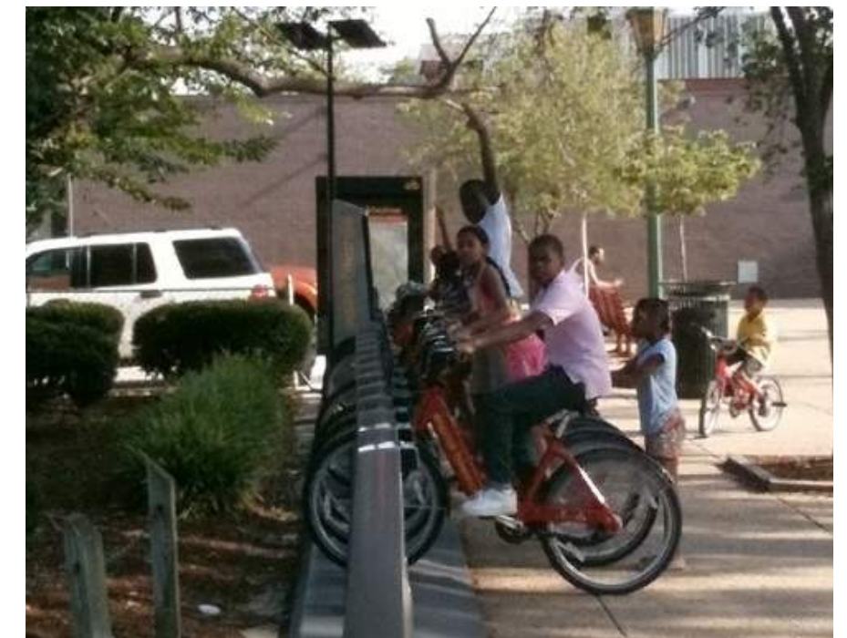
Bike Station (Washington, D.C)