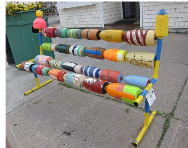
Artistic street furniture (Belfast, Maine)