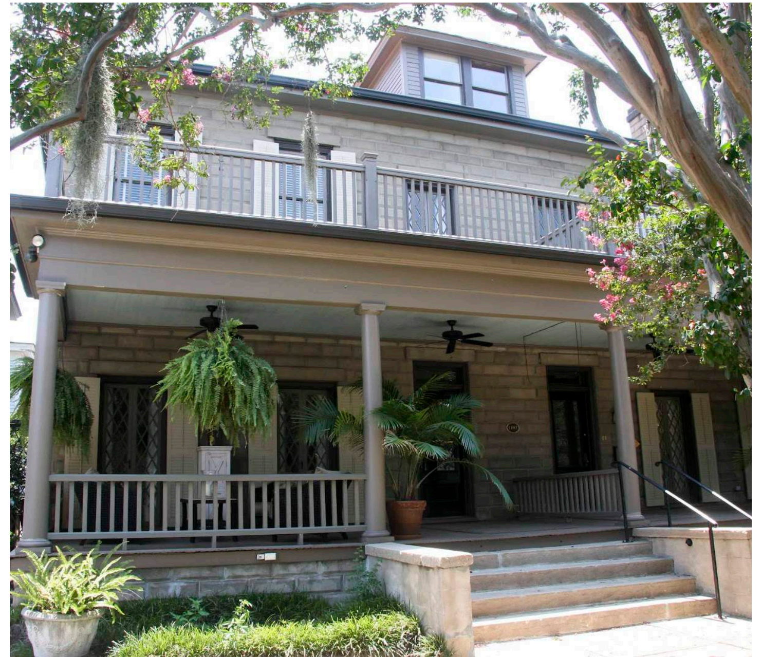
Porch, street trees, sightline of the street, enabled surveillance from the inside and outsiders cannot easily look inside structure (New Orleans, Louisiana)