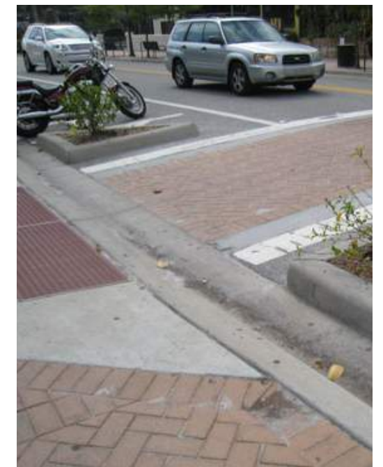
Crosswalk Island (Cambridge, Massachusetts)