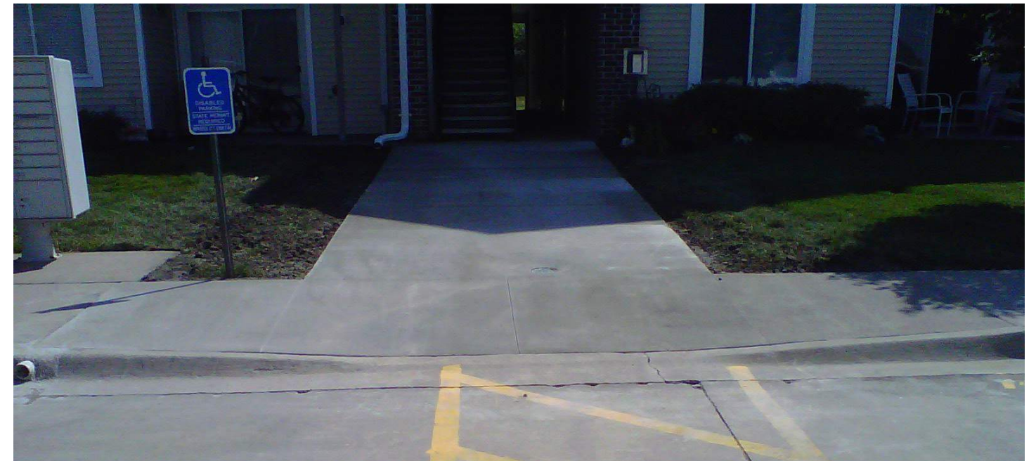
Entrance over 5 paces from circulation route (Des Moines, Iowa)