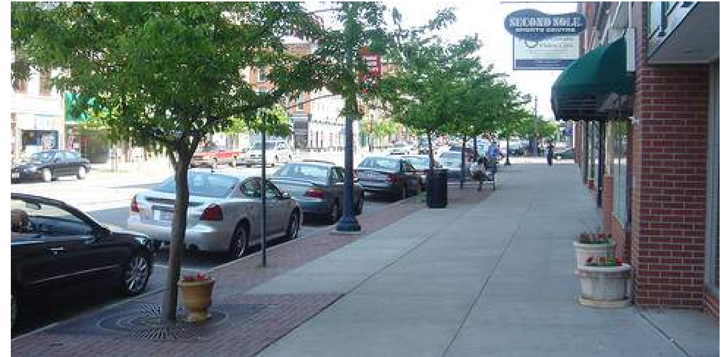
Sidewalk that is over 8 ft wide, contains street trees, utilizes on-street parking as a barrier, and is oriented toward retail facilities (Columbus, Ohio)