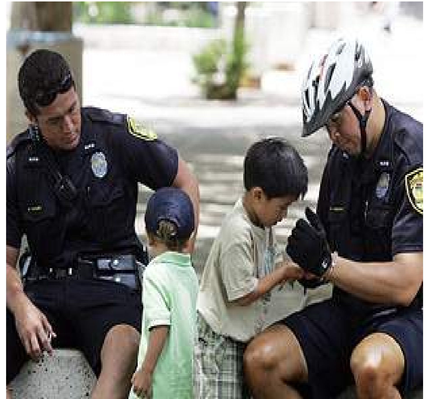
Police officers helping youth (New York, New York)