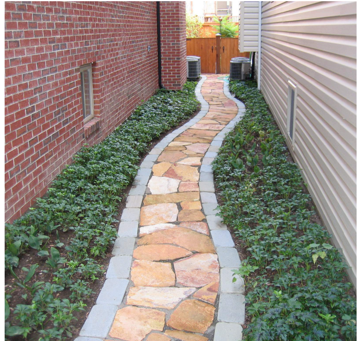
Hidden and narrow informal path constructed of natural materials and adjacent to green elements (Chicago, Illinois)