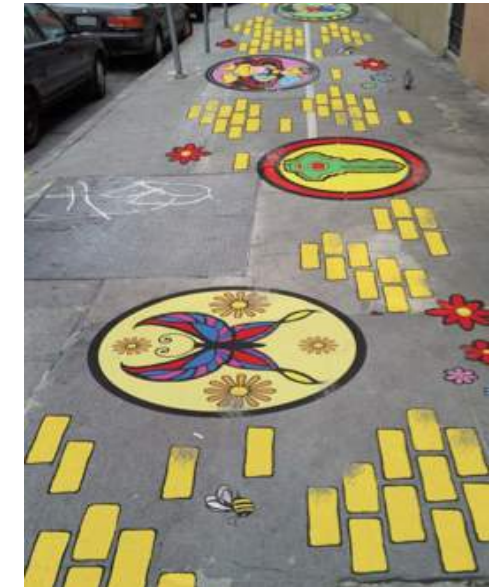
Dedicated Iconography (San Francisco, California)