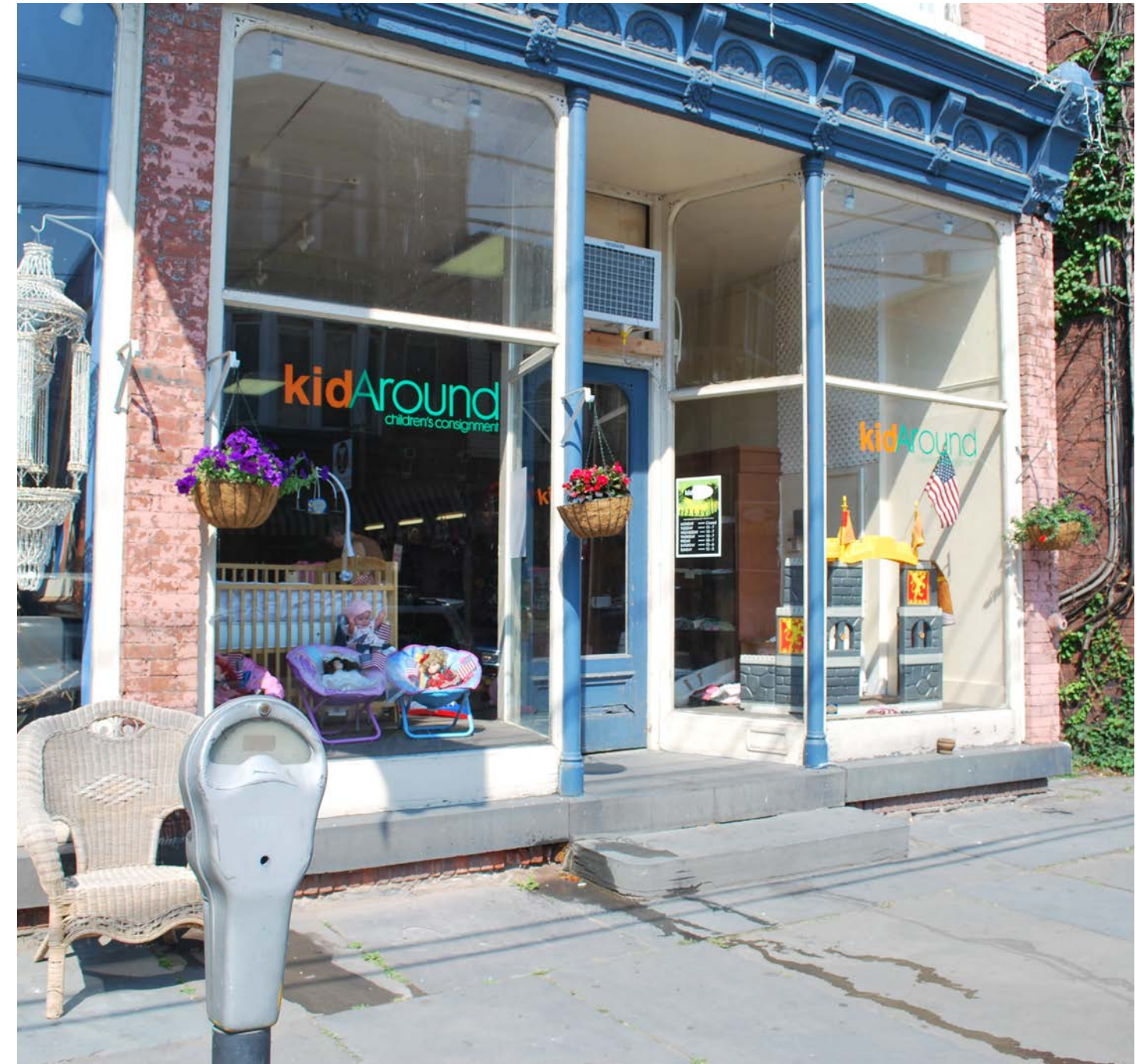
Child-friendly store with glass storefront (Saugerties, New York)