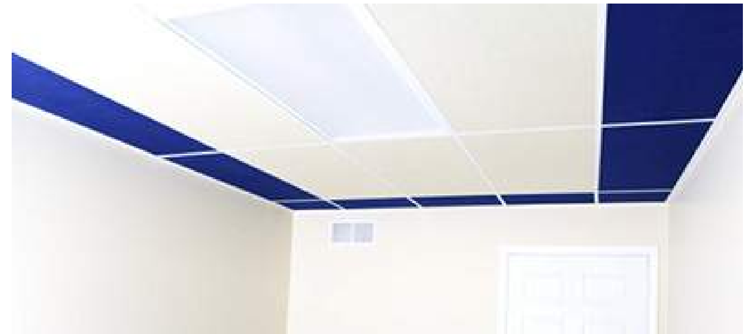
Acoustic ceiling panel