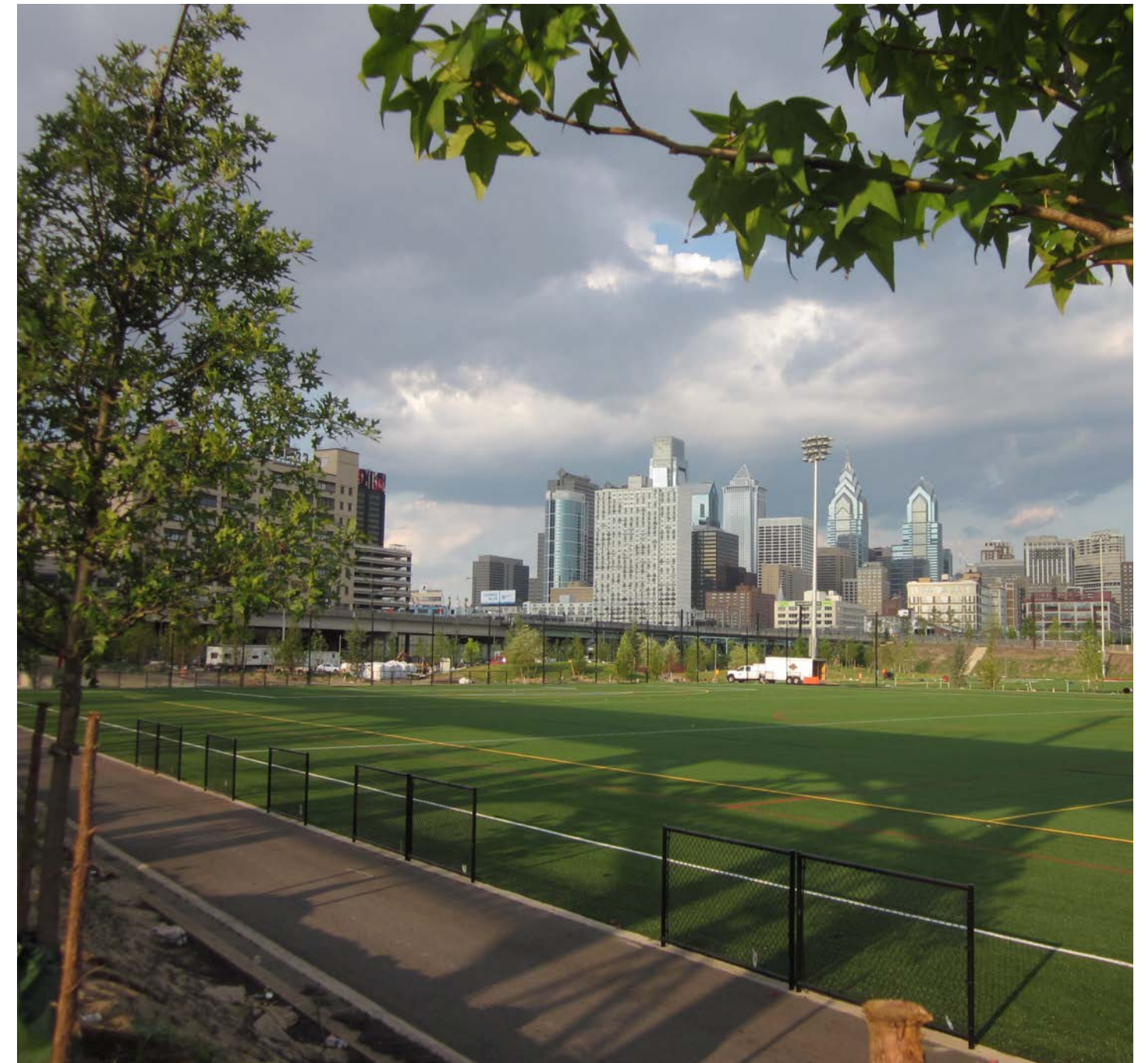
Multi-use public soccer field (Philadelphia, Pennsylvania)