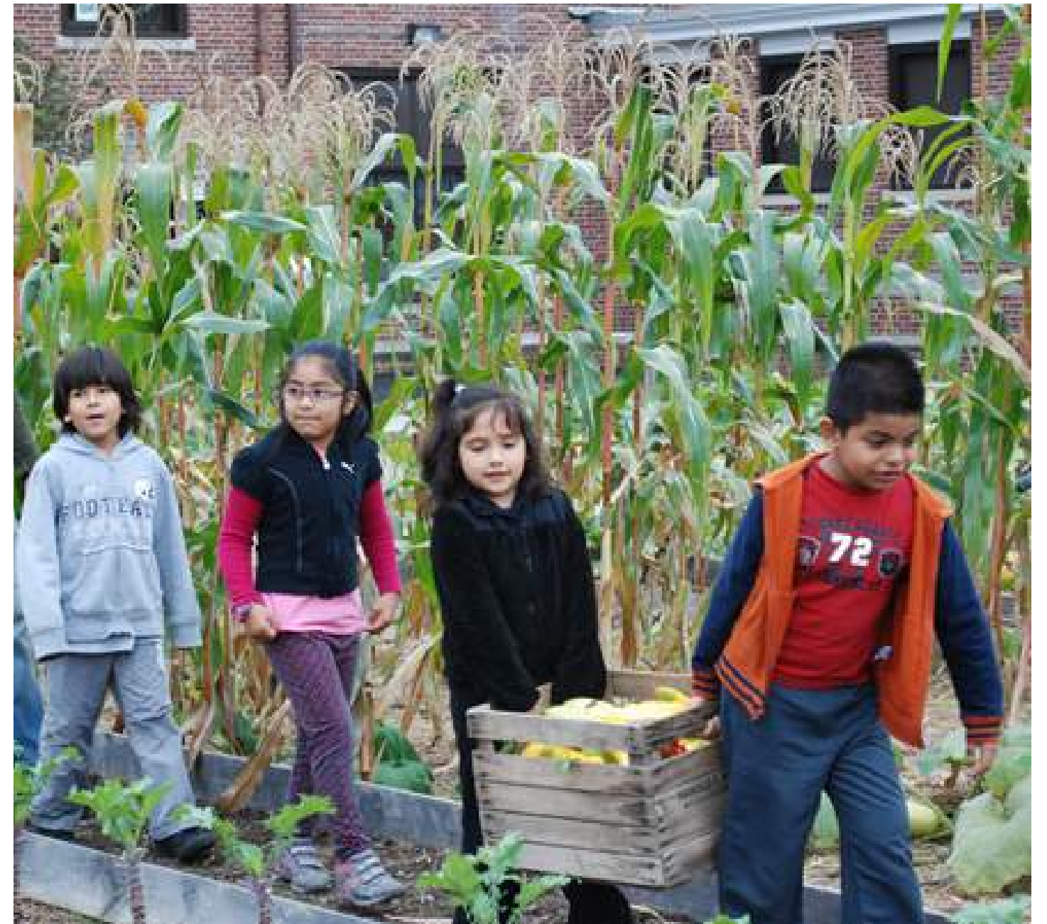
Children working in unfenced yet protected community garden (Columbus, Ohio)