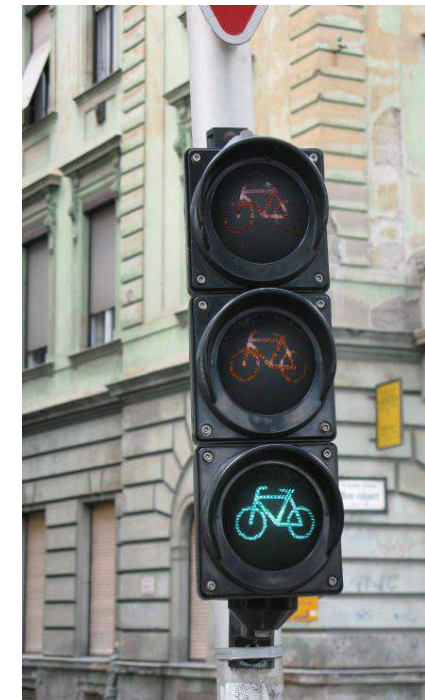
Bike specific traffic light (Budapest, Hungary)