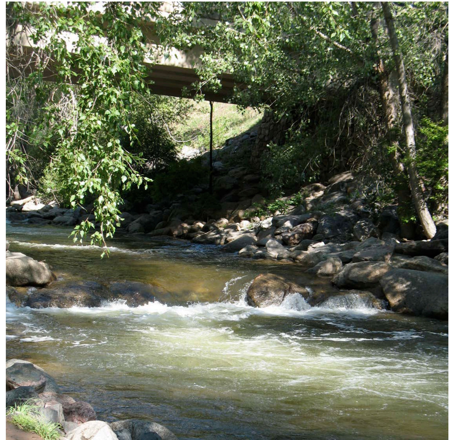
Natural landscape in high density area (Boulder, Colorado)

-Produce transformability by showcasing natural play materials (leaves, rocks, sand, water, branches, and flowers). {8}