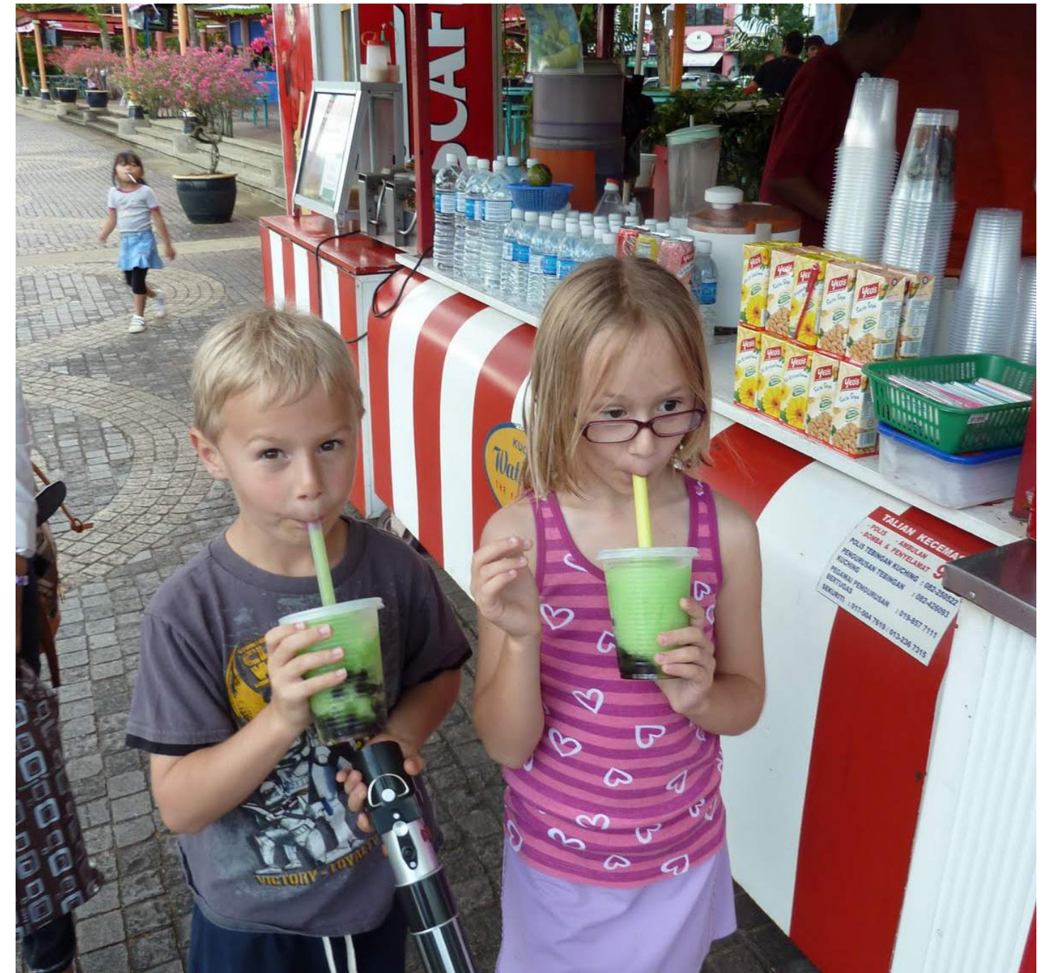
Food Carts (India)