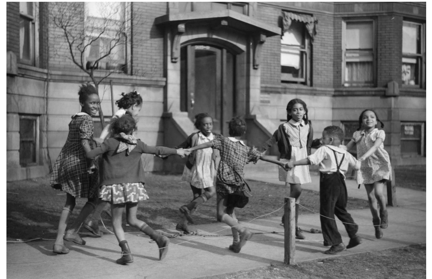
Children playing on a city street (New York, New York)

city child friendly, the four topics of transportation, built form, outdoor space, and city services/retail, their respective subtopics, and the design guidelines within the subtopics must be appropriately applied into high density neighborhoods in a child friendly fashion. The next page begins with the transportation topic, and more specifically states the importance of utilizing numerous design methods that make cycling child-friendly in high density neighborhoods.