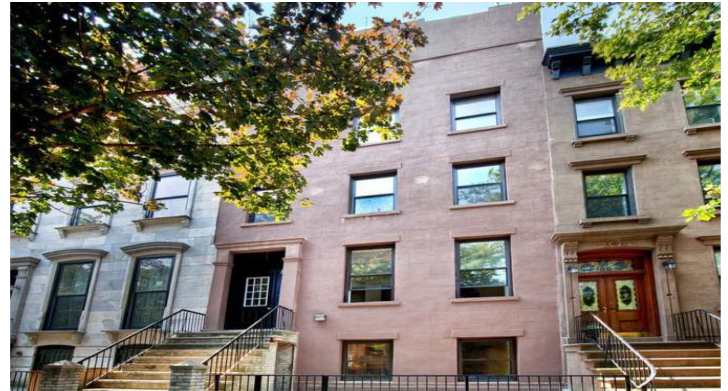
Varying paint shades, windows, and clear formal entrances (New York, New York)

-Clearly identify informal and formal entrances. {2}