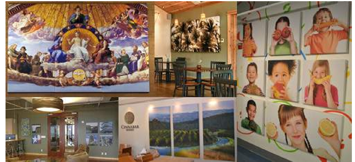
Variety of artistic acoustic wall panels

-Minimize noise within an individual dwelling by avoiding the construction of open floor plans, and by implementing acoustic panels, acoustic baffles, and varying ceiling heights. {7}