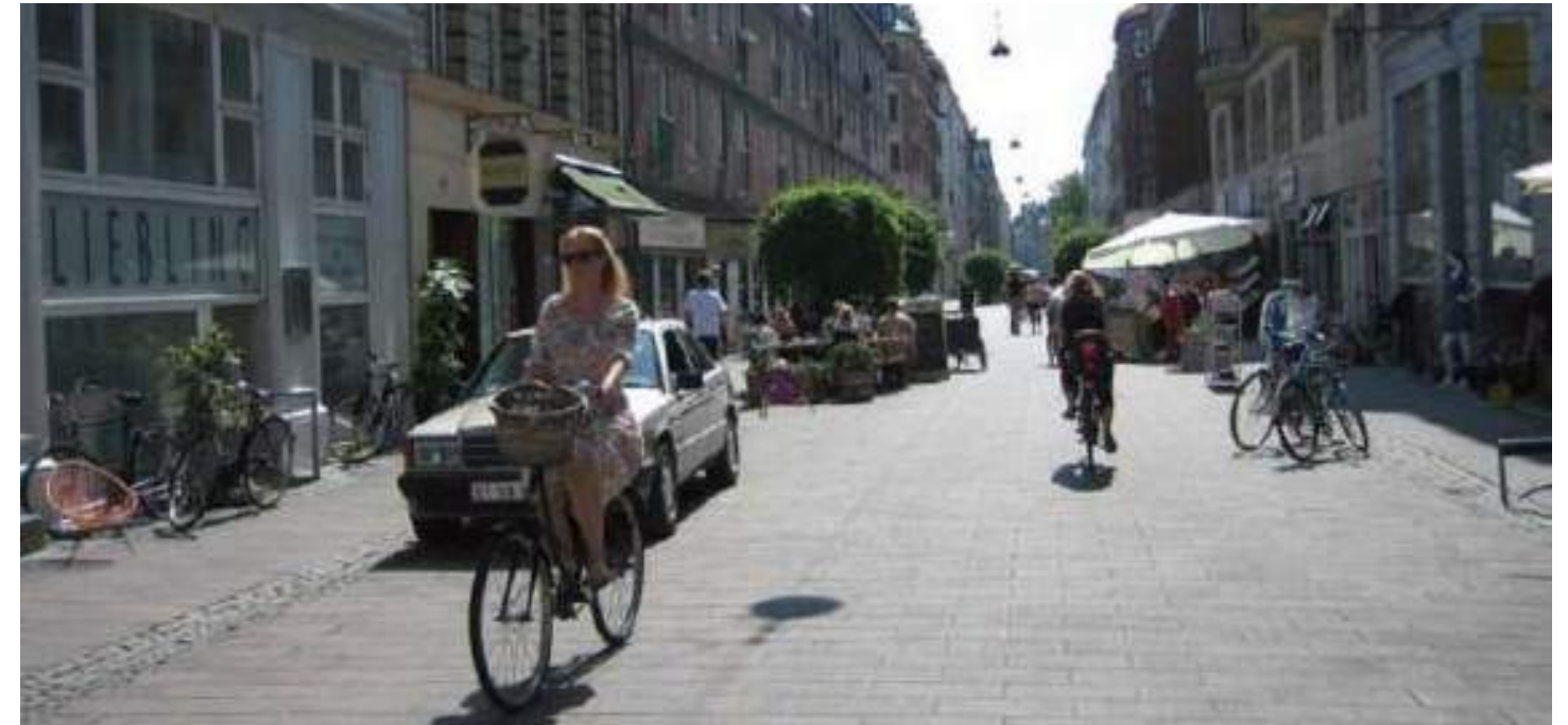
Woonerf (Copenhagen, Denmark)

-Differentiate the land material among crossing areas and the rest of road. {4}