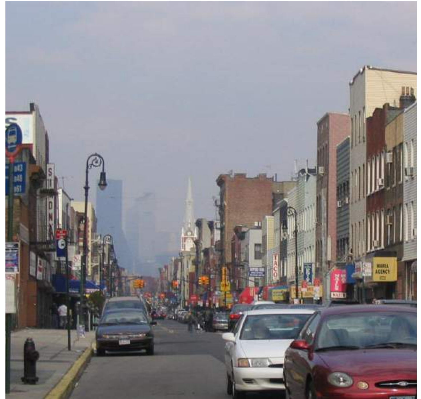
Mixture of building heights that are all under 6 stories tall (New York, New York)