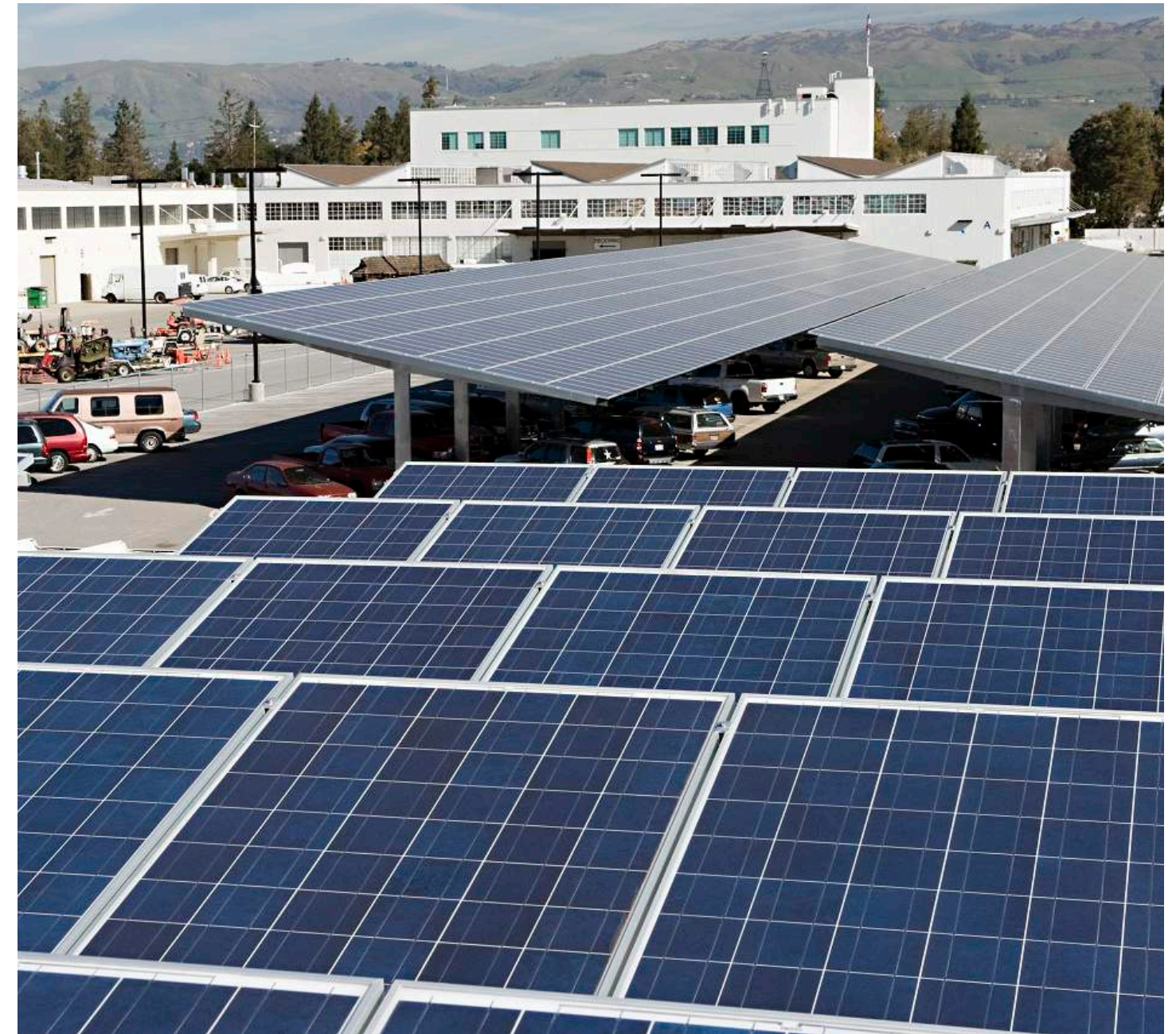
Solar Canopy Parking Lot (San Jose, California)