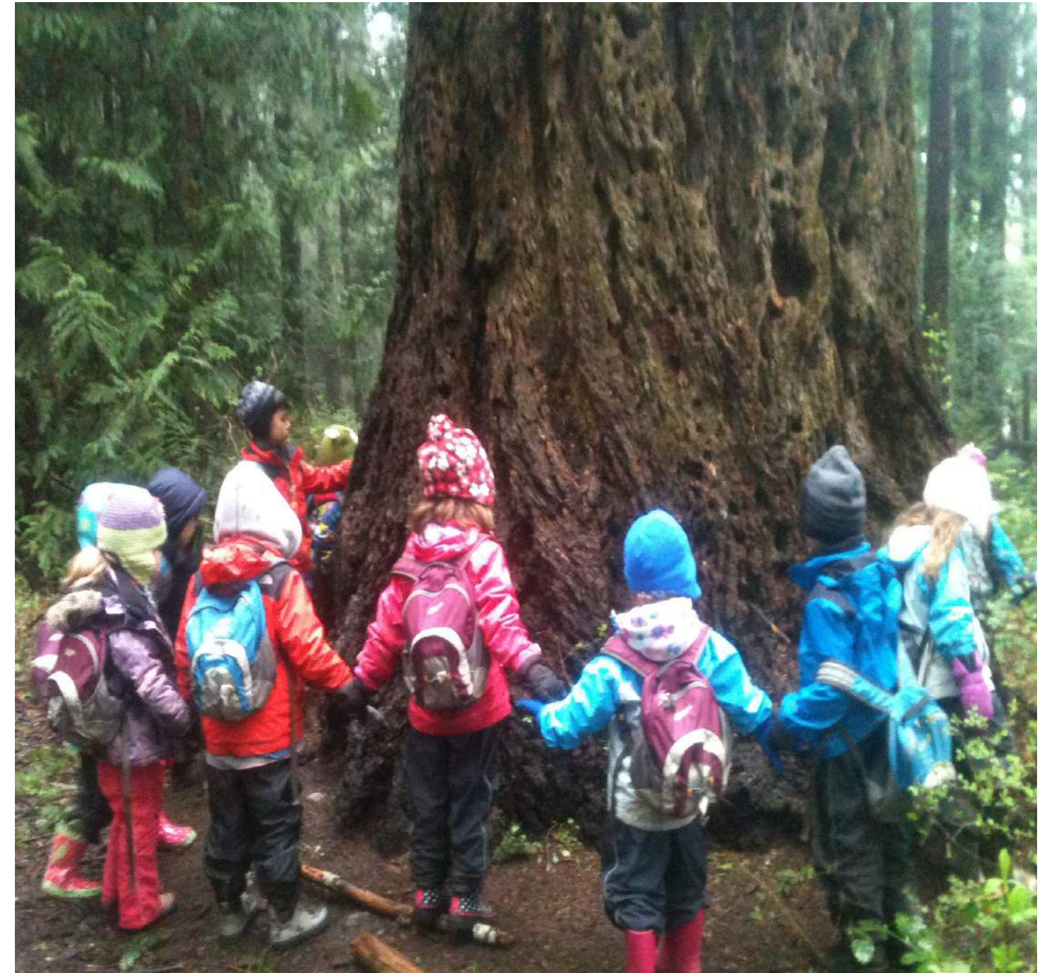
Nature kindergarten (Victoria, Canada)