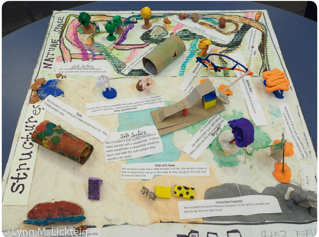
2nd grade students at Whittier International Elementary School designed and built a model for a UAD playground.