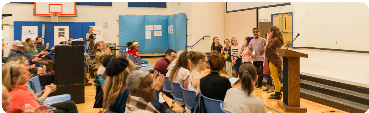
4th grade students from Flatirons Elementary School presenting their work on the 11th Street Corridor Design at a Metrolab event in December 2017.