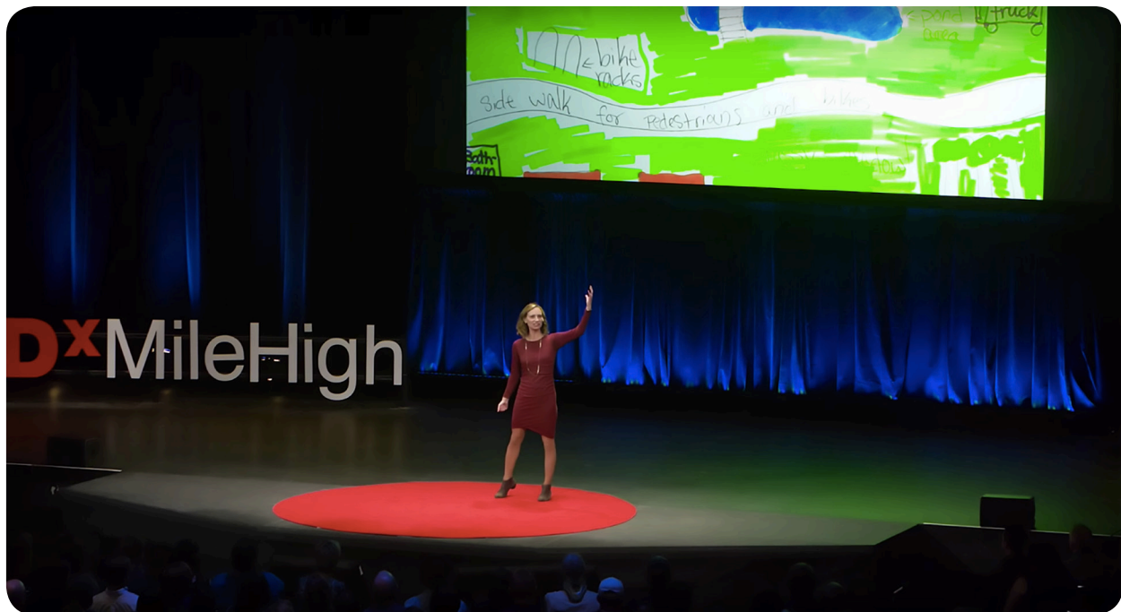
Mara Mintzer delivering a TEDx Talk “We Let Kids Design Our City - Here’s What Happened” at TEDxMileHigh in November 2017.